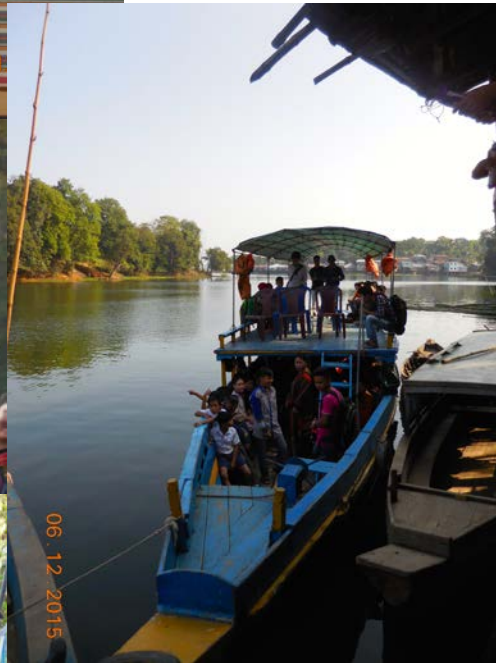
On the bridge and Our boat!