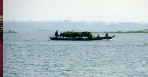
And off on a tour of the lake with all the performers