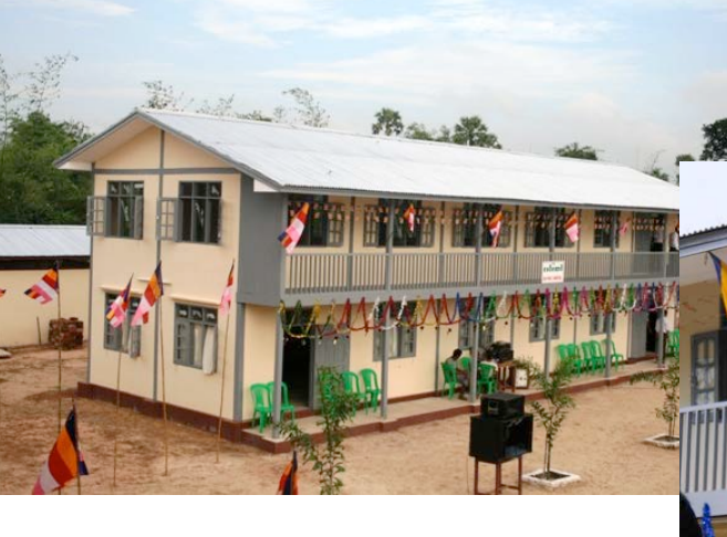
opening until next year when we will have

preliminary opening and then The-Real-Thing next year so that the building could be occupied. OF COURSE we chose the latter and so here are the pictures for the pre-opening = soft