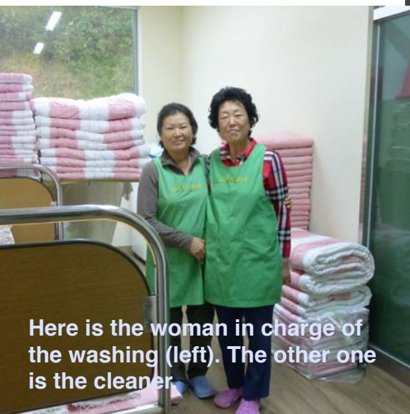
Here is the woman in charge of the washing (left). The other one is the cleaner

them inside on the railings along the halls. I felt so sorry that they had not been able to buy an industrial machine and so asked them to research one. Please see the attached file.